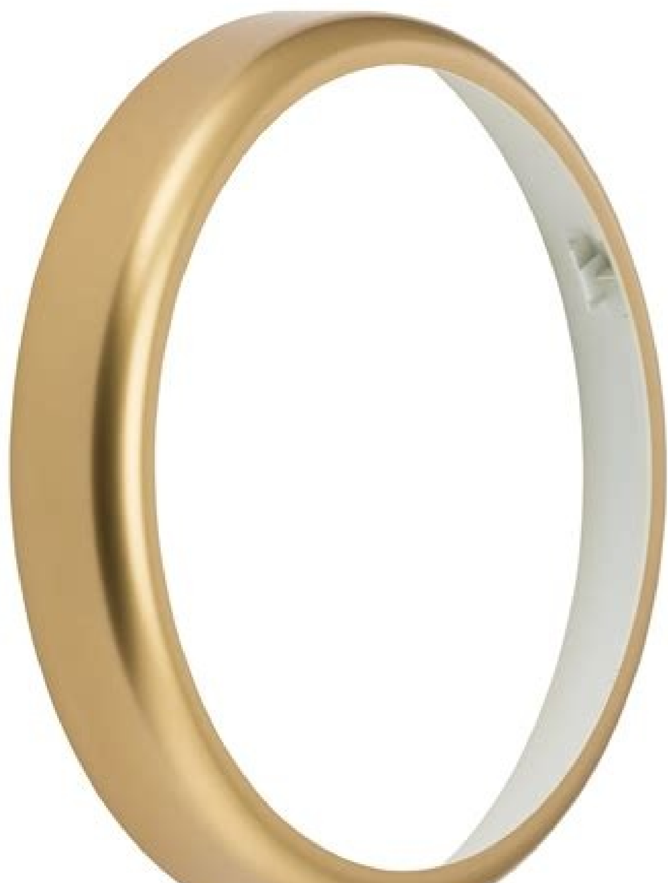
C3604 brass datasheet.